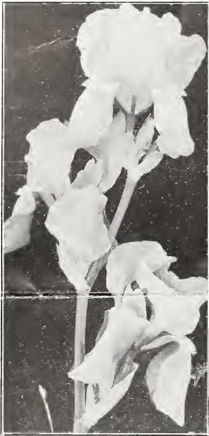
Giant Lavender from LONG'S Garden

"The exquisite beauty of the iris, with its soft and iridescent coloring, is rivaled only by the orchid," so the saying goes. But I would add—"and the gladiolus." The iris comes and goes before the gladiolus appears, so there is no rivalry, and both are happy and make us all happy for having seen them.